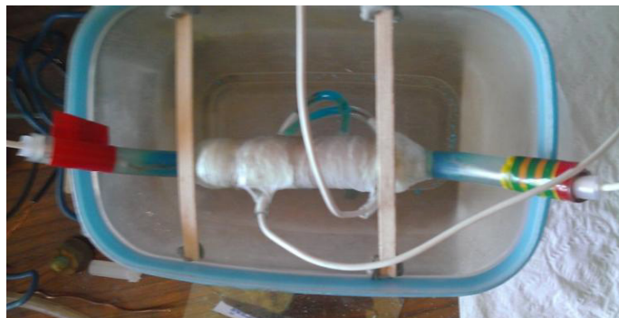
Fig. 1: Installation for IP measurements, the sample is in the centre, in the plastic tube.

Sediments were sampled at seven sites from Portet-sur-Garonne (Toulouse upstream) to Grenade (downstream of the city) within the riverbed. Each time, we have kept the fraction 50-200 microns for the measures, which allows for more homogeneous samples from one site to another.